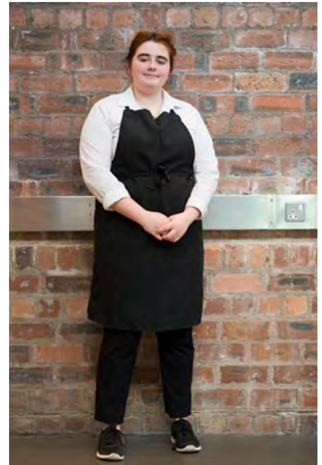
Coffee Point staff member.

At the Engine Shed these people can help you.