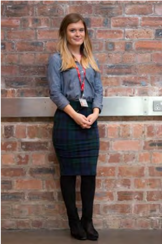
Engine Shed staff member.